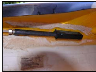
Glide tube fitted to glide box as seen from inside cockpit